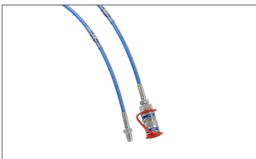
High Pressure Hose

The following complementary equipment can be purchased as a set together with cylinder or separately.