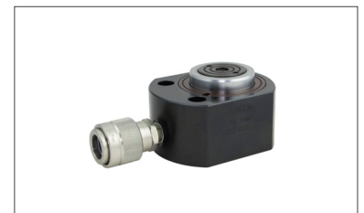
Low Profile Cylinders