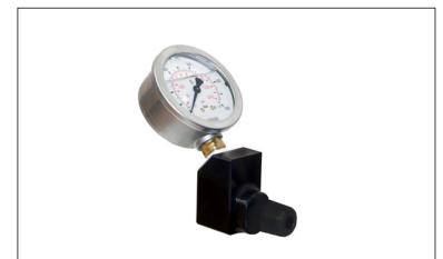
Gauge and Adapter