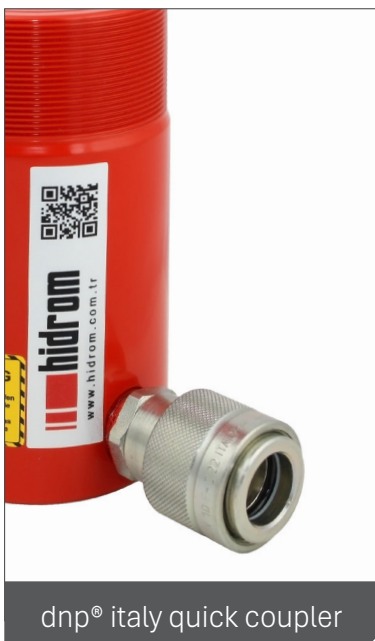
dnp® italy quick coupler