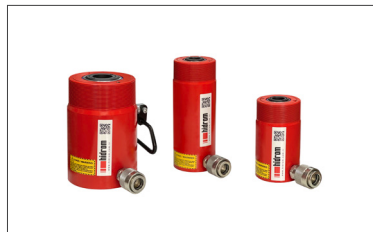
Hollow Plunger Cylinders