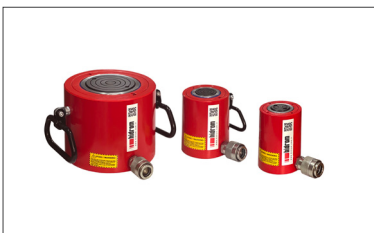
Low Height Cylinders

The following products can also be selected according to the requirements of application.