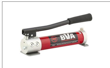
Hydraulic Hand Pump