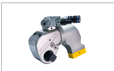
SQ Drive Torque Wrench

The following complementary equipment can be purchased as a set together with pump or separately.