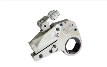
Cassette Torque Wrench